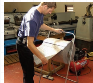
GRS38 and AFRD/38 Floor Stand